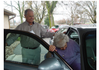
A volunteer driver "on the job"

Volunteers received a workbook, viewed a DVD and received classroom instruction designed to minimize the effects of aging and help drivers feel better behind the wheel. Topics included adjusting speed, risks of driving, seeing, margin of safety, changes to IN traffic laws, negotiating roundabouts and more.