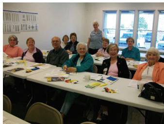
Class participants take a break

In 2008, Samaritan Caregiver volunteers gave 1322 accident-free rides to people in Howard County age 65 & over, ill or disabled.